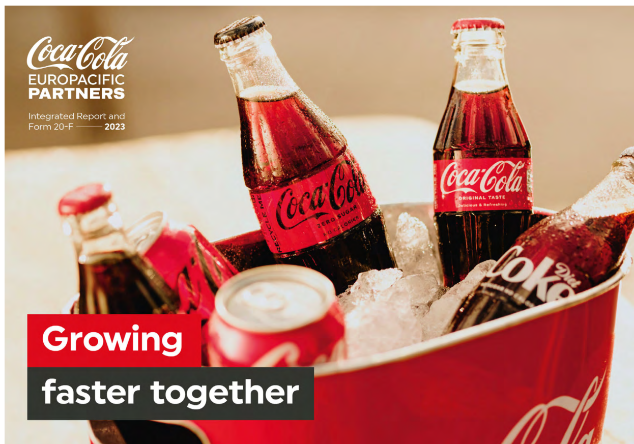
Cover page of the Coca-Cola Europacific Strategic report 2023: https://www.cocacolaep.com/assets/Global/Investors/Integrated-Report/2023-CCEP-Integrated-Report_Web-15.03.2024_v3-Interactive-Version-1.pdf

This shift is intentional: For example, Coca-Cola aims to derive over 50% of its sales in Europe from low or no-calorie drinks by 2025. To achieve this, it states that it will reduce the average sugar content in its beverages by reformulating existing products, such as Fanta Orange, and offering zero-calorie options alongside sugar-reduced variants. 15 PepsiCo, the other big soft drink player in Europe, has adopted a similar approach, setting targets to reduce the average level of added sugar in its EU soft drinks portfolio by 25% by 2025 and 50% by 2030. The company has already seen progress, with its no-sugar volume mix increasing by 5 points to reach 31% in 2021. 16 However, reliance on artificial sweeteners is unlikely to stem from a newly found commitment to public health. The industry's track record tells a different story. For instance, Coca-Cola has historically targeted children and teenagers with multi-million-dollar marketing campaigns while simultaneously lobbying against regulations like advertising bans or sugar taxes. The company has also funded research favouring industry interests – tactics that closely resemble those employed by the tobacco industry. 17