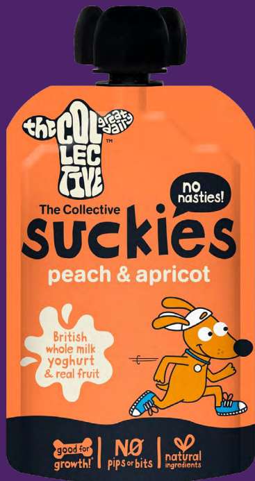
Asda product with "No Nasties" claim, https://groceries.asda.com/product/kids-yogurts-fromage-frais/the-collective-great-dairy-suckies-peach-apricot/1000383141825 Screen shot from 07.01.2025

While a UK High Court initially sided with Asda in 2009, stating that the "No Nasties" label did not imply aspartame was harmful, the Court of Appeal overturned this decision in 2010, allowing Ajinomoto to proceed with its claim. The case ultimately settled out of court in 2011, with Asda agreeing to remove references to aspartame from its packaging. This case highlights the industry's willingness to take legal action to defend its products and control public perception, ensuring that criticism of aspartame remains muted in the marketplace. 24, 25