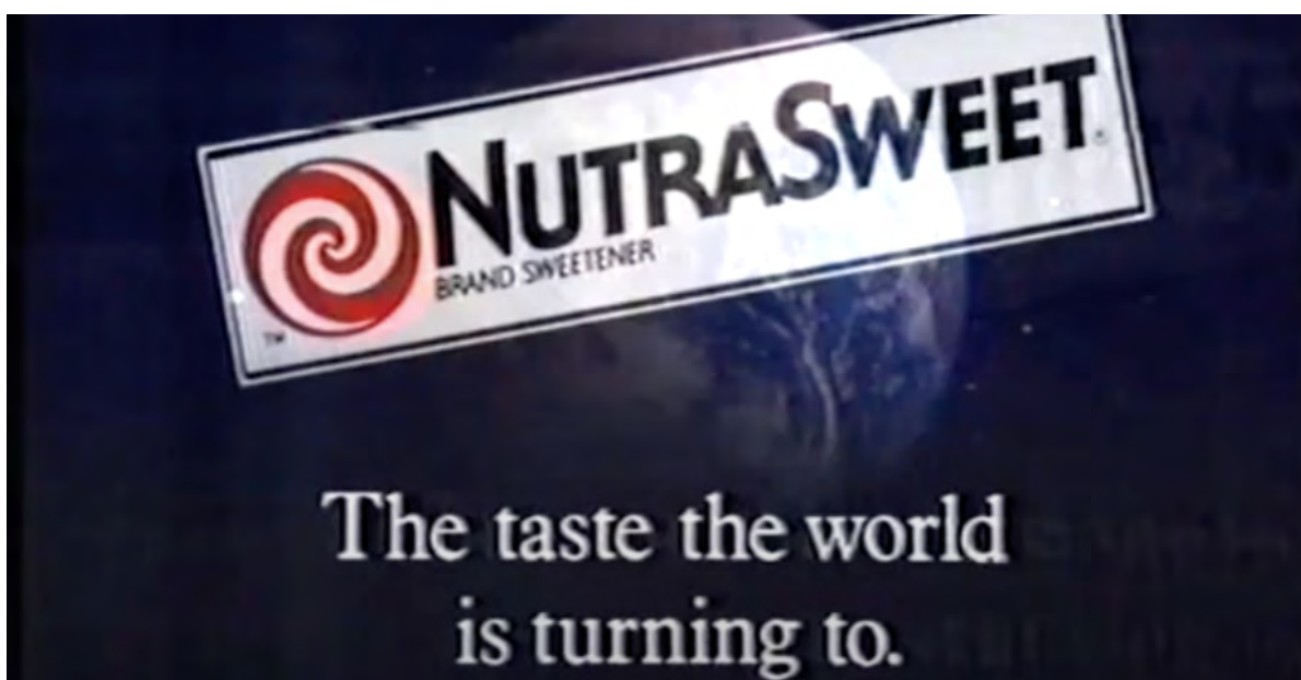
90's NutraSweet TV commercial, https://www.youtube.com/watch?v=EloufRS-Ua0 , screen shot from 07.01.2025

Many consumers became familiar with aspartame through the brand NutraSweet , which gained prominence in the 1980s and 1990s. NutraSweet was widely used as a low-calorie sweetener in various products, and its presence was bolstered by extensive advertising campaigns. 10