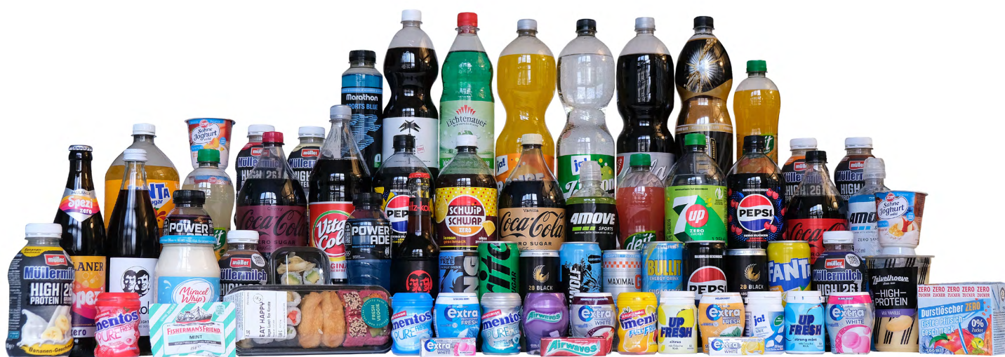
Food products containing aspartame (Germany, January 2025).

Aspartame, a sweetener found in approximately 6,000 products worldwide, 6 plays a significant role in the beverage industry, offering an option to avoid regulatory actions on sugar. Its safety has been a topic of heated debate for decades, and in 2023, this controversy was reignited following opinions by two international authorities: IARC (the WHO's International Agency for Research on Cancer) and JECFA (the Joint FAO/WHO Expert Committee on Food Additives). The two bodies reached apparently conflicting conclusions – while IARC classified aspartame as "possibly carcinogenic to humans", JECFA maintained that it poses no harm to consumers. In an unusual move, both organisations issued a joint statement that left the public more confused than reassured. 7 The following sections argue that the findings of IARC and independent research provide compelling grounds for a precautionary ban on aspartame.