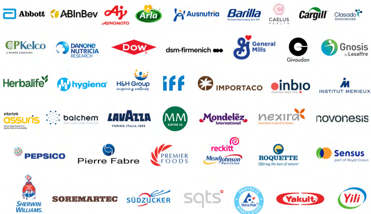
ILSI Europe members: https://ilsi.eu/community/our-members/ , screen shot from 07.01.2025

The International Life Sciences Institute (ILSI) presents itself as a group that is committed to "science for the public good" and to "improve planetary and human health and well-being in the 21st century". 160 ILSI is a corporate-funded non-profit organisation with 10 regional units worldwide. 161 It was founded by a former Coca-Cola vice president and has been funded for decades by companies such as Coca-Cola (until 2021), 162, 163 and Mars (until 2018) 164 and it currently includes companies such as Pepsi and the world's largest aspartame manufacturer Ajinomoto in its members. 165 Companies appear to benefit from the organisation's prolific publication of scientific studies that present their products and practices in a positive light and casually trivialise the potential health risks associated to their consumption.